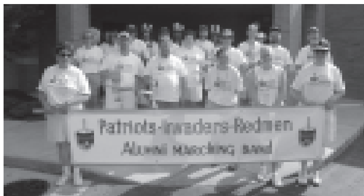
Photo was taken after the July 4th parade.